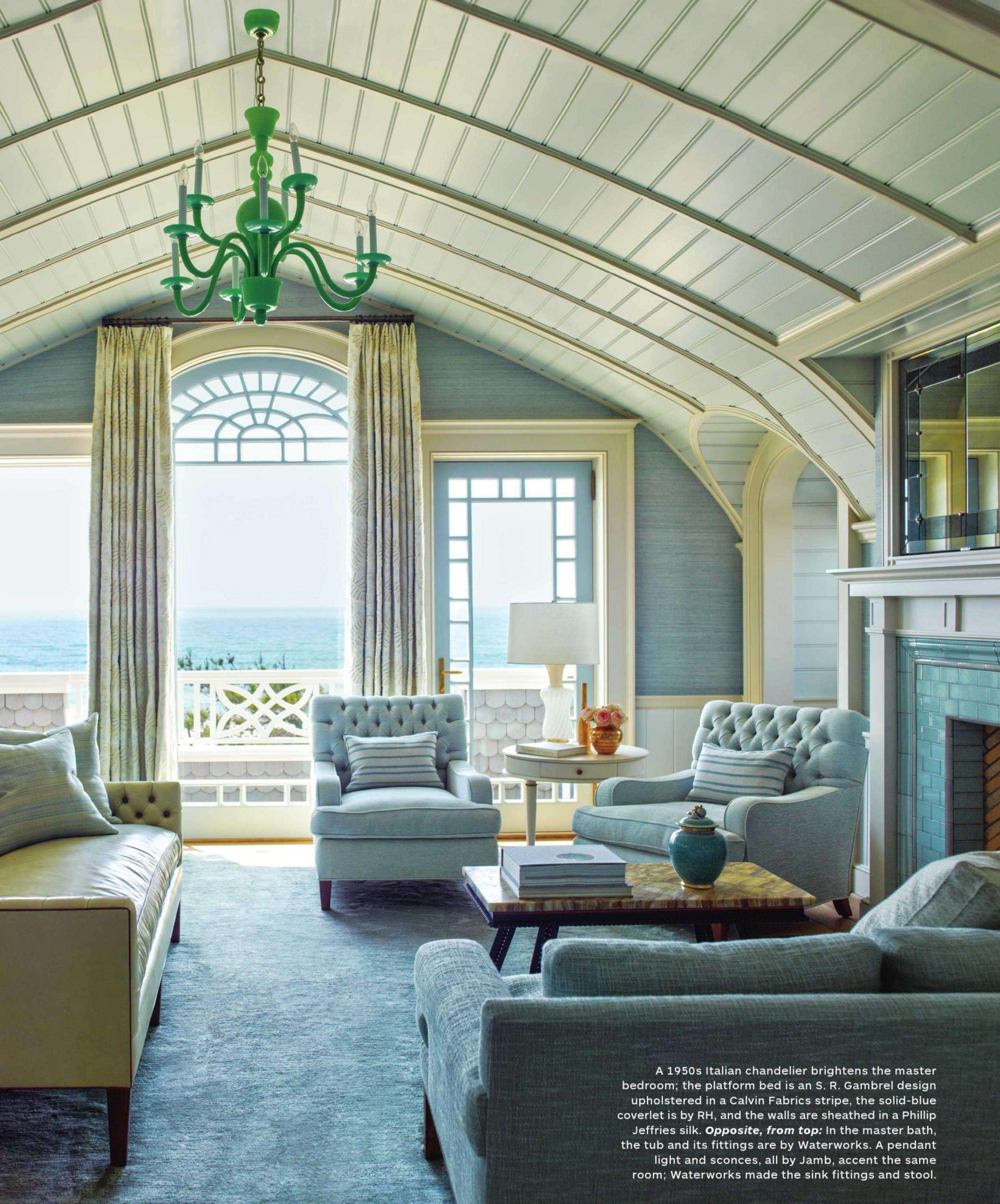
A 1950s Italian chandelier brightens the master bedroom; the platform bed is an S. R. Gambrel design upholstered in a Calvin Fabrics stripe, the solid-blue coverlet is by RH, and the walls are sheathed in a Phillip Jeffries silk. Opposite, from top: In the master bath, the tub and its fittings are by Waterworks. A pendant light and sconces, all by Jamb, accent the same room; Waterworks made the sink fittings and stool.