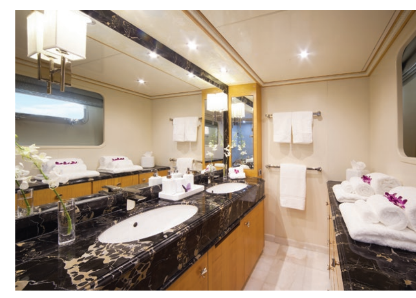
THESE PAGES: WORK IN THE CABINS INCLUDED BRINGING THE TWO MASTER SUITES UP TO AN EQUAL STANDARD AND REPLUMBING THE ENSUITES WHILE PRESERVING THE MARBLE