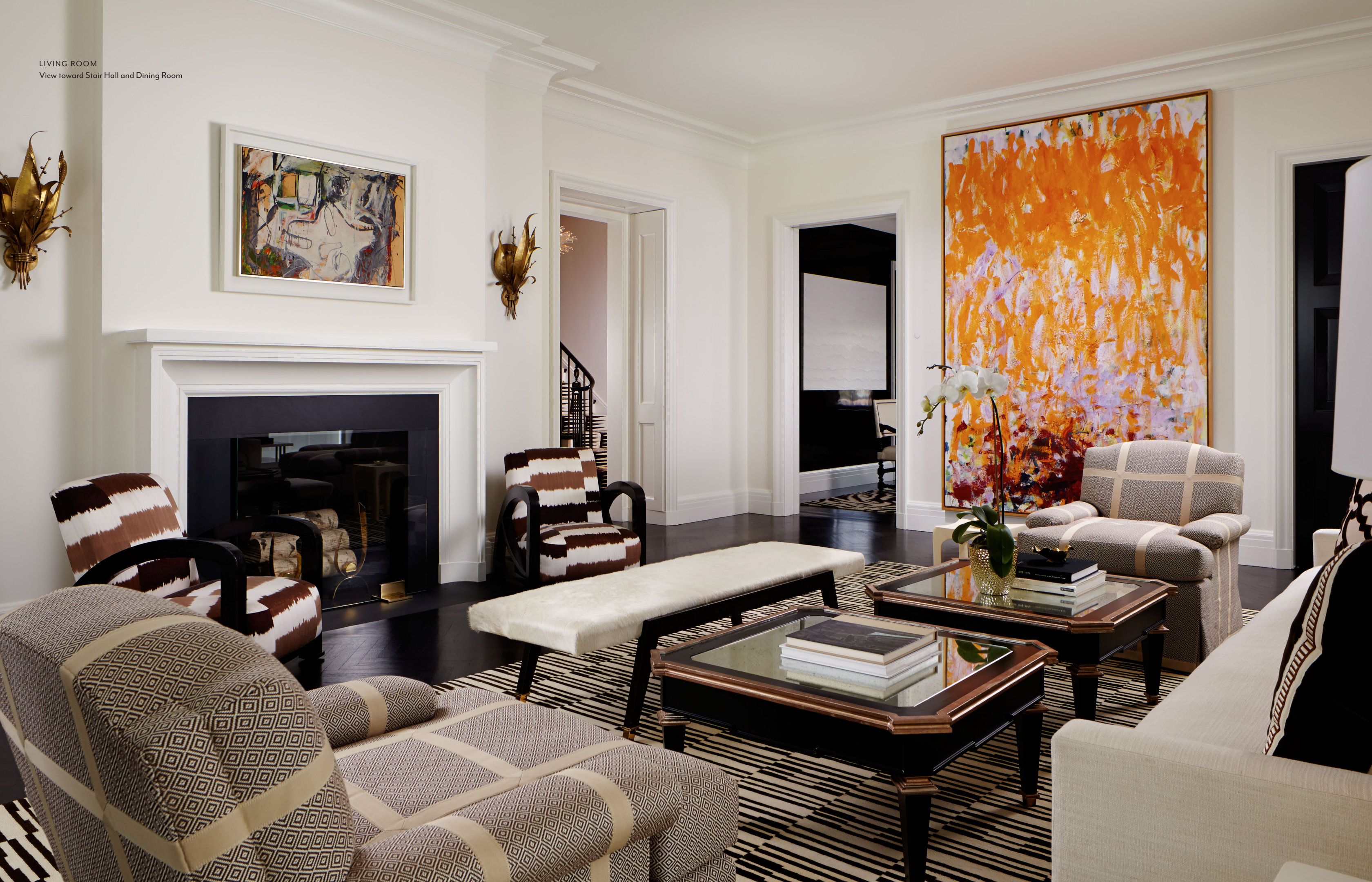
LIVING ROOM View toward Stair Hall and Dining Room