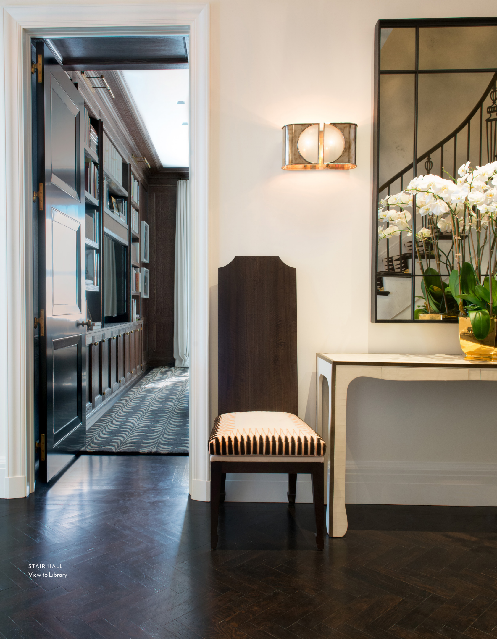
STAIR HALL View to Library