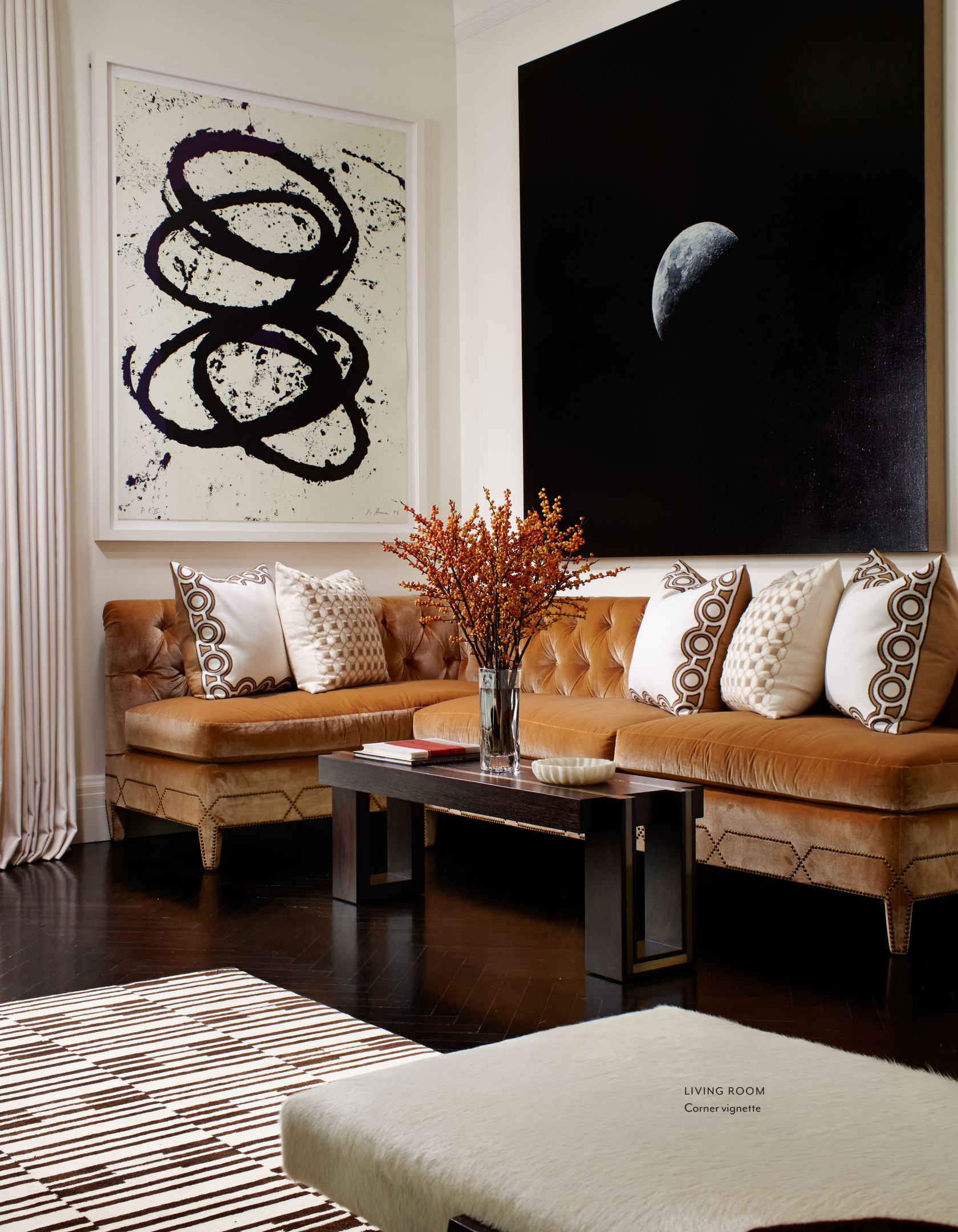
LIVING ROOM Corner vignette