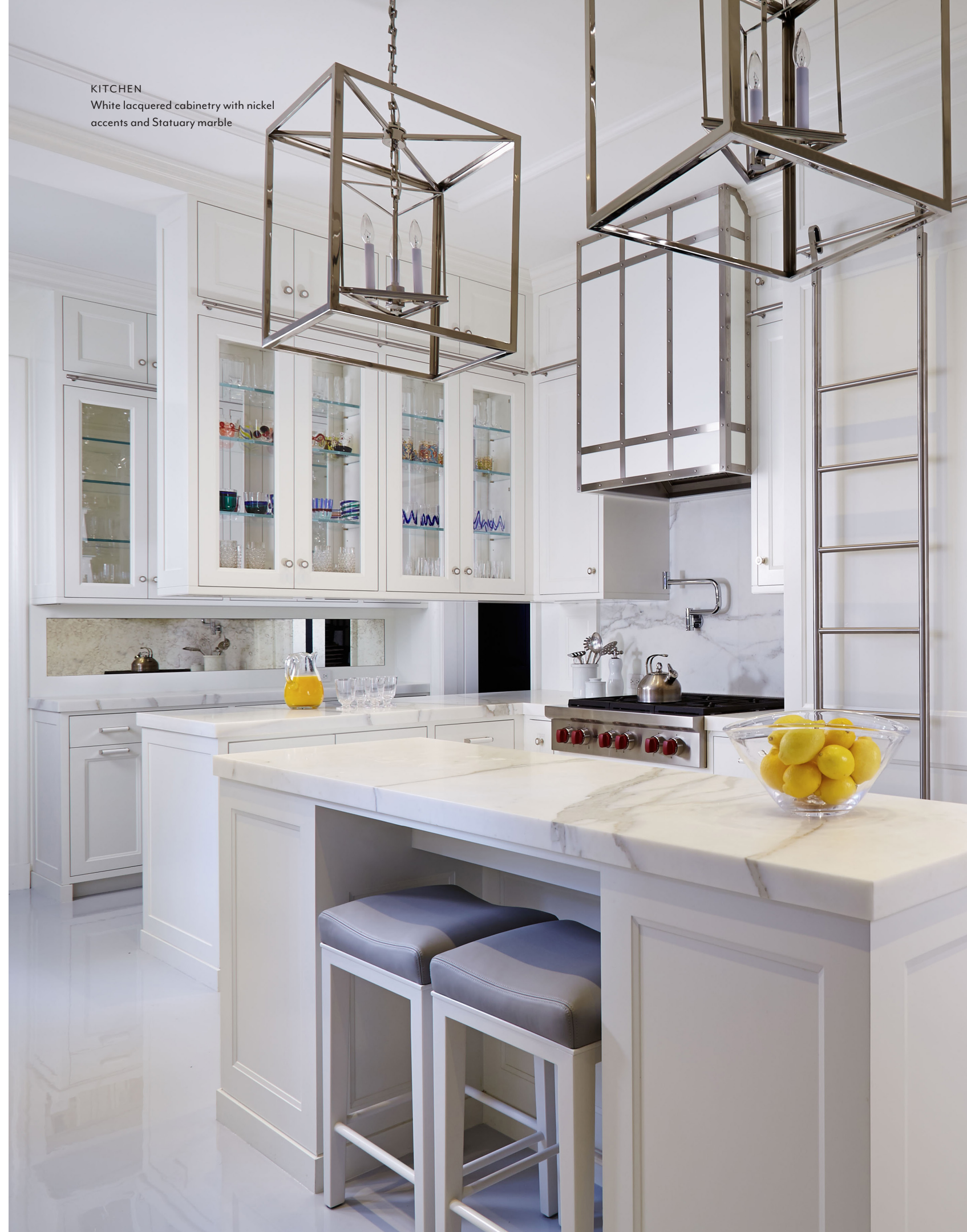
KITCHEN White lacquered cabinetry with nickel accents and Statuary marble