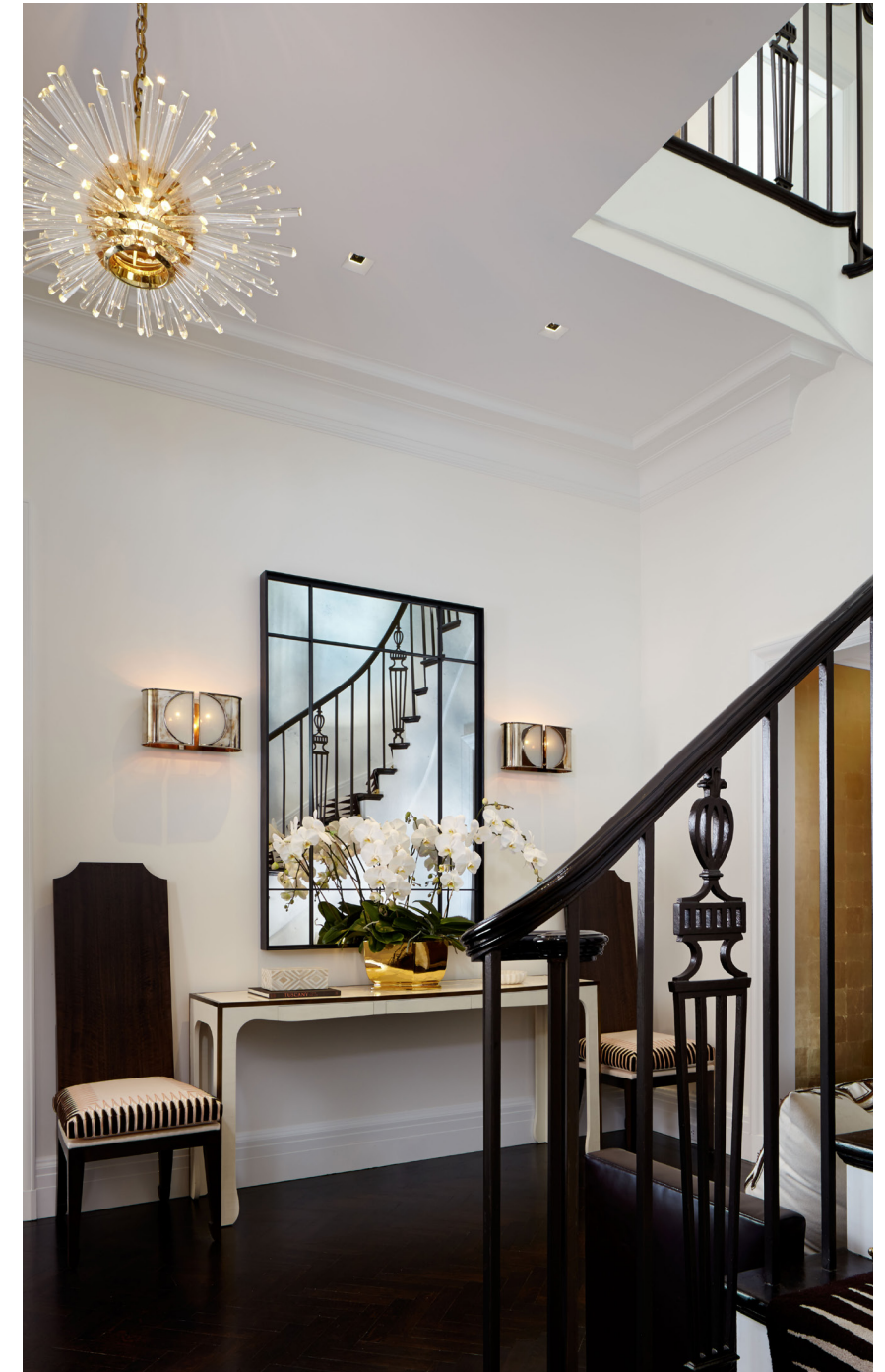
STAIR HALL Detail of original stair rail