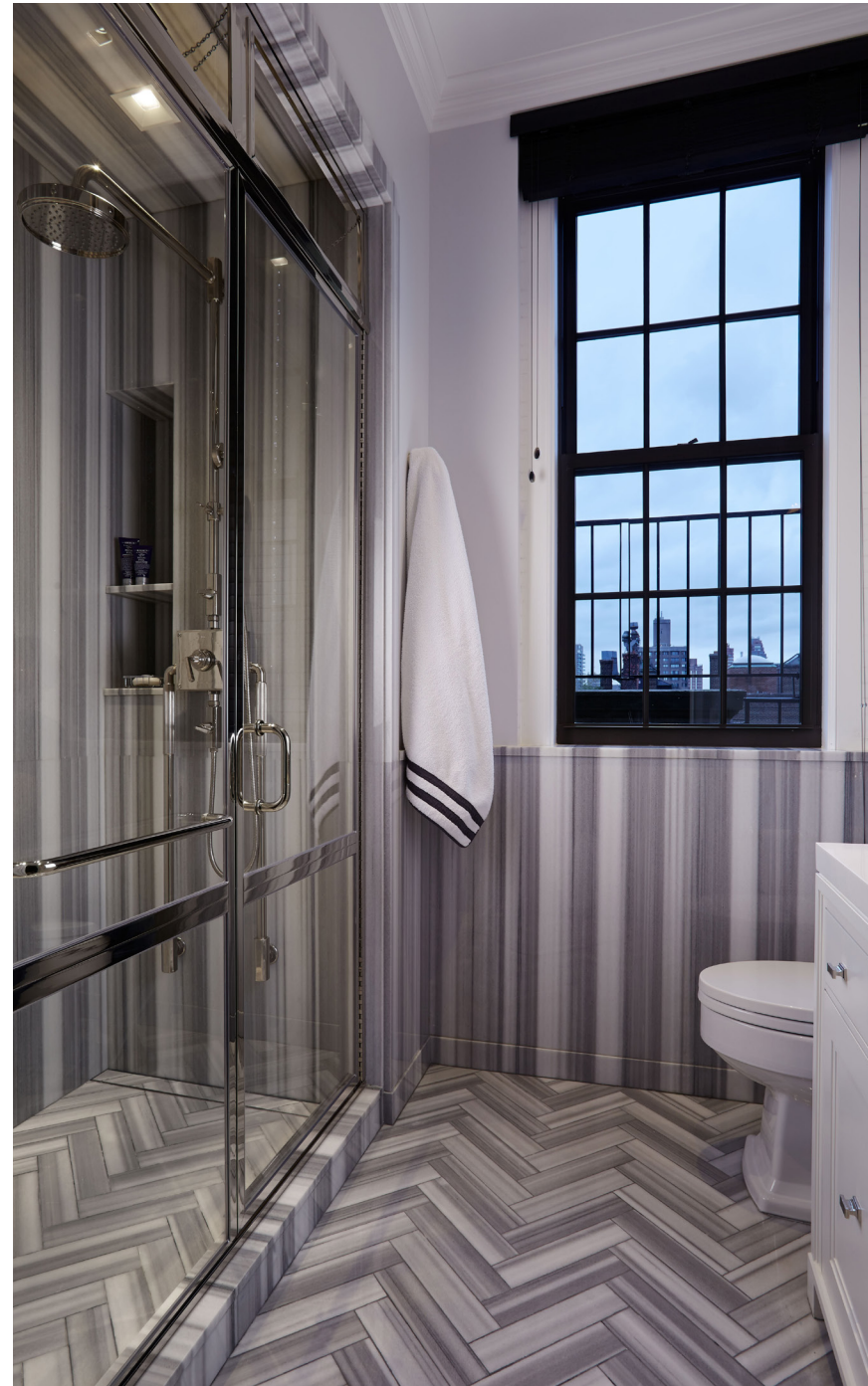
GENTLEMAN'S BATH Zabrino marble floor and walls