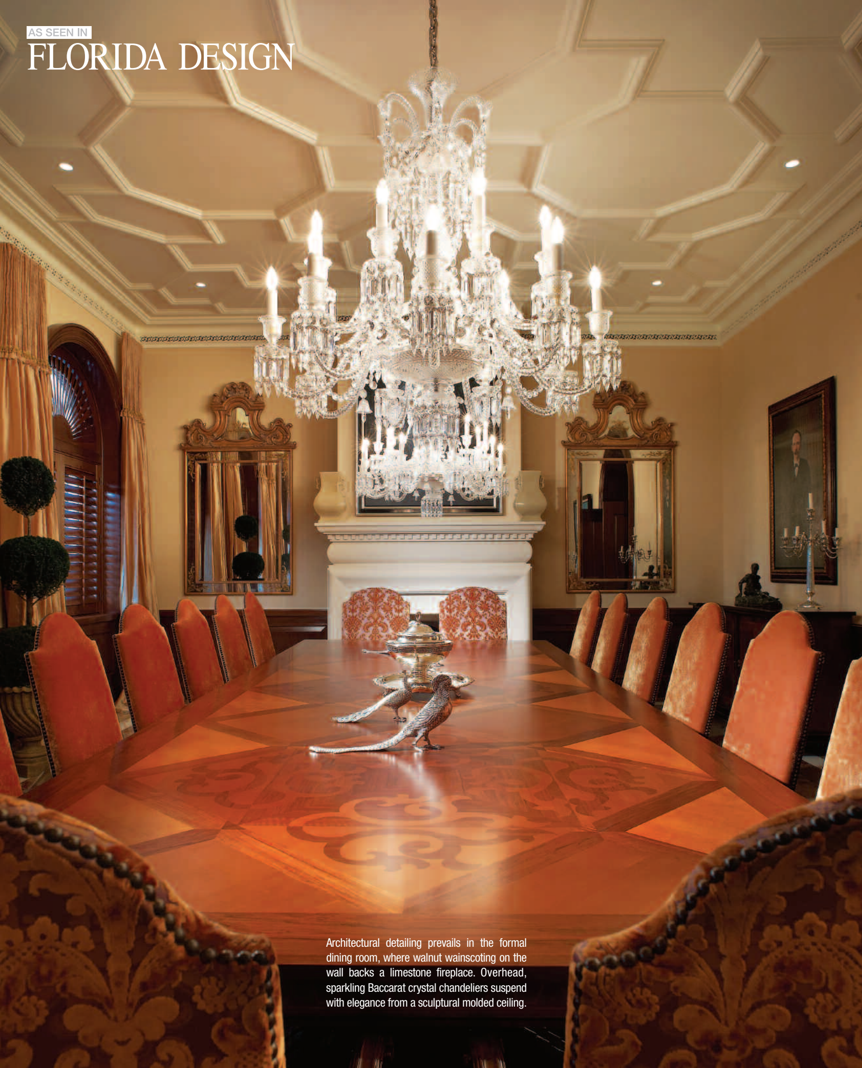
Architectural detailing prevails in the formal dining room, where walnut wainscoting on the wall backs a limestone fireplace. Overhead, sparkling Baccarat crystal chandeliers suspend with elegance from a sculptural molded ceiling.

“We have seven landscaped acres with tennis courts, a boat house and a pool house — we need two golf carts just to get around,” homeowner Constance Fernandez says.